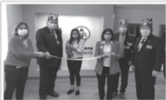
A virtual ribbon-cutting ceremony and tour took place on March 19, 2021 with representatives from both Shriners Children's Ohio and Dayton Children's Hospital

As Chairman of the Board of Governors of Shriners Children's™ Ohio in Dayton, Ohio , I can tell you that Shriners Children's Ohio is going to be a wonderful place for children and their families to receive the same life-changing care we've provided for so many years.